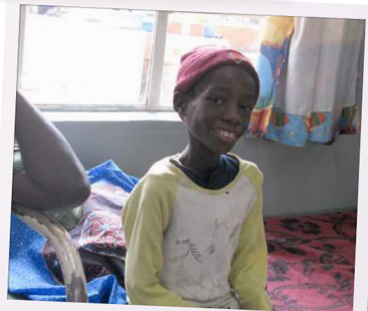
Name: Prince Aged 12